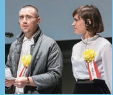
Award ceremony after the final screening (First Place)