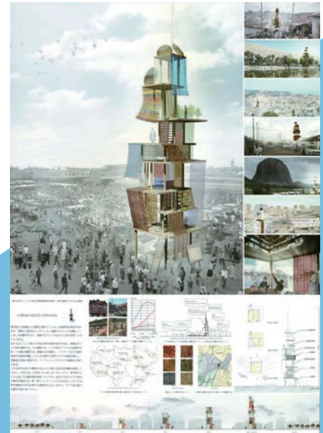
First Place design in the 48th Competition (2013) Theme: Bringing the Urban Environment into Architecture

A fiftieth anniversary lecture event and party were held last year to commemorate the fiftieth anniversary of the Central Glass International Architectural Design Competition.